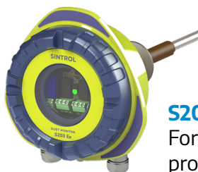
S200 series For filter and process monitoring