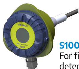
S100 series For filter leak detection