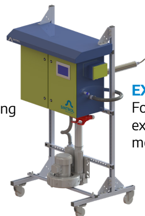
EXO For wet gas extractive dust measurement