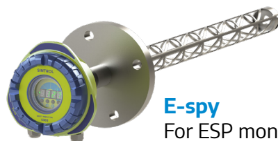
E-spy For ESP monitoring and control