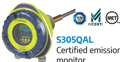
S305QAL Certified emissions monitor