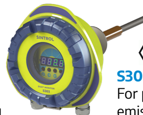
S300 series For process and emissions monitoring